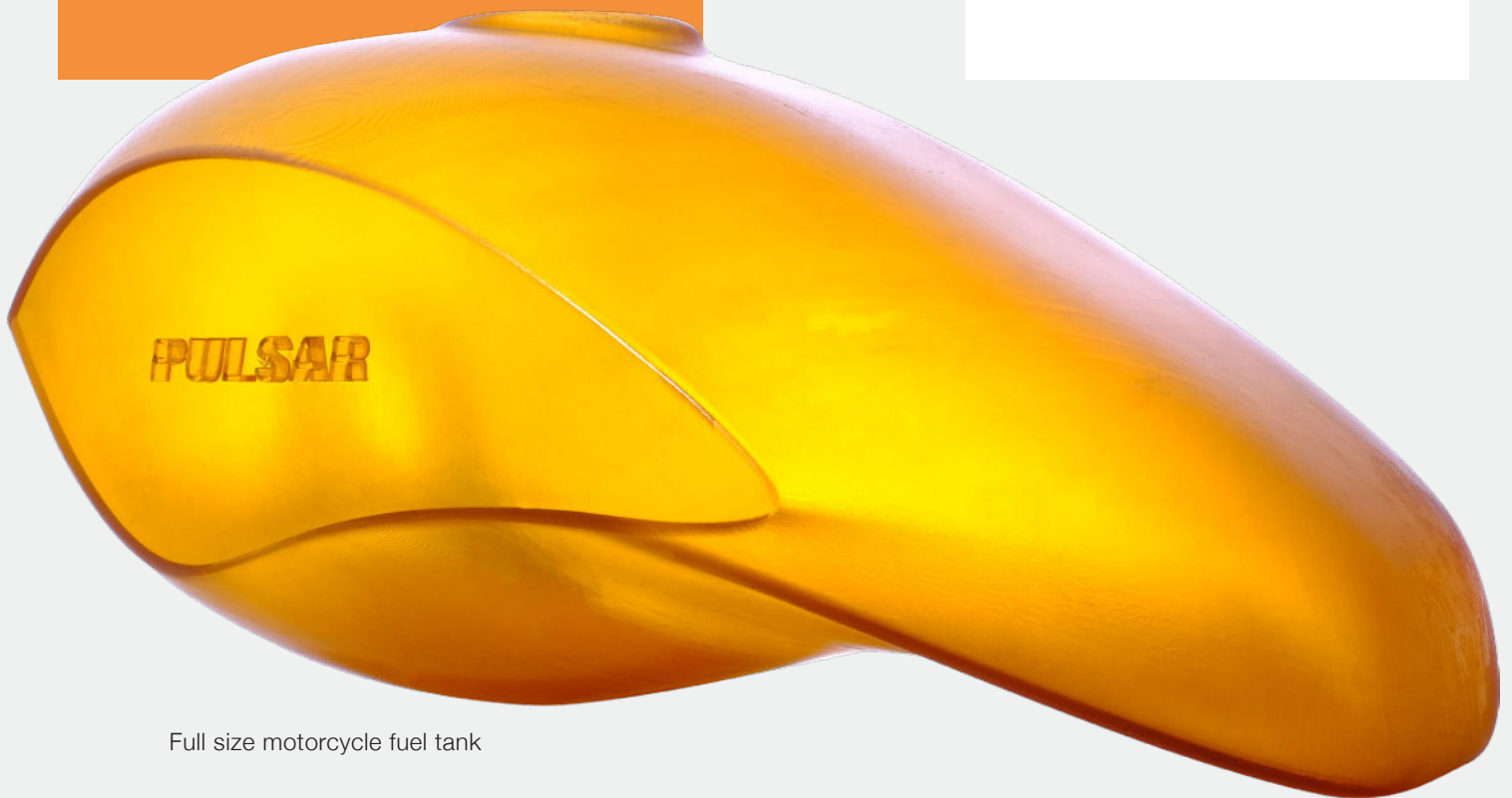
Full size motorcycle fuel tank

Photocentric's HighTemp DL400 is the first Photocentric high temperature resistant resin possessing superior properties of both strength and stiffness. It can handle impact, compression, fatigue, high temperatures and moisture without bending or deforming, able to print with an impressive layer thickness of 350µm.