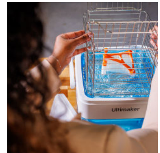
PVA Removal Station Remove water-soluble PVA support material up to 4X faster