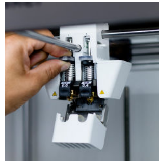
Print core CC Ruby-tipped for printing abrasive glass and carbon fiber composites. Available in 0.4 and 0.6 mm