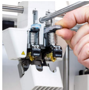
Print core BB Quick-swap nozzles for build and water-soluble support materials. Available in 0.25, 0.4, and 0.8 mm