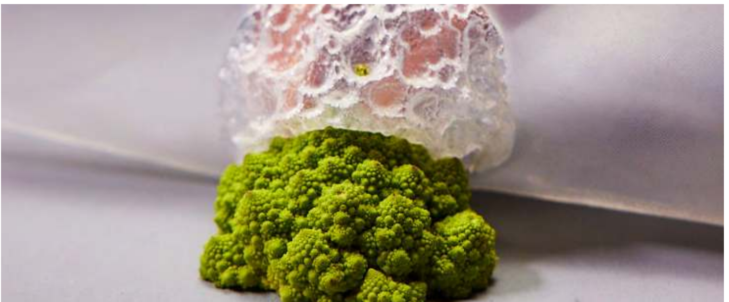
Mouse casings by Beta Design Office.