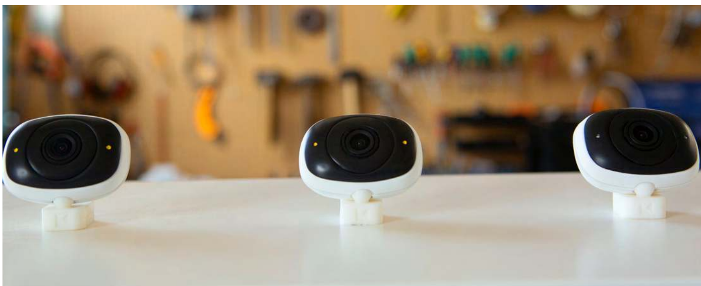
Webcam casings by Beta Design Office.