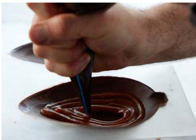
Magnolia petal-shaped chocolate mold by Philip Khoury.