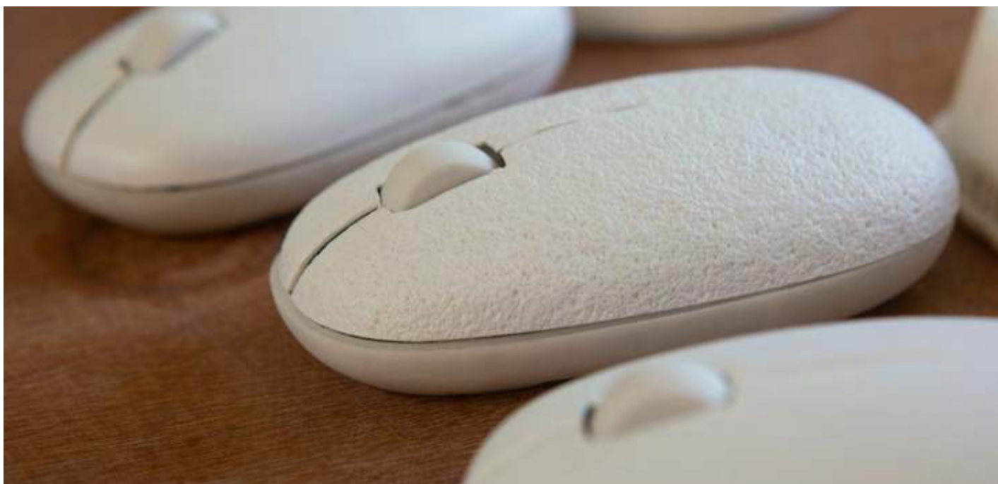
Mouse casings by Beta Design Office.