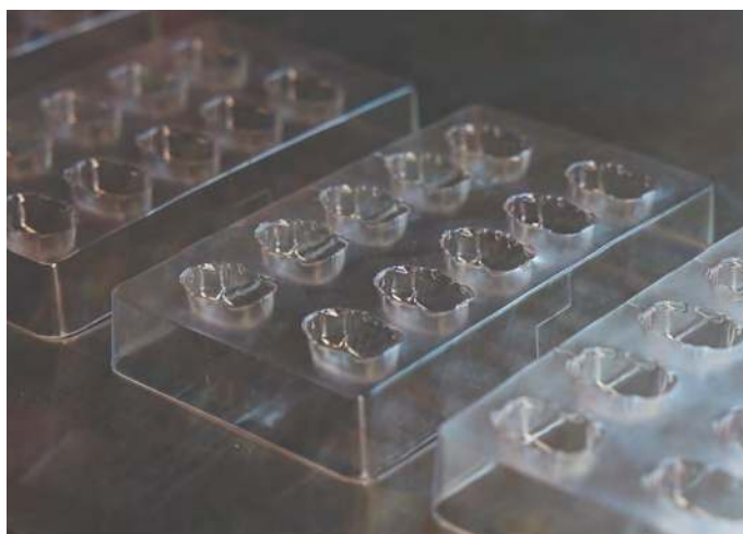
Beetle-shaped bon bon chocolate molds by Paul A. Young.